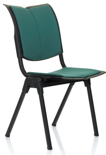
HÅG Conventio Wing 9831