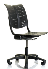
HÅG Conventio Wing 9812