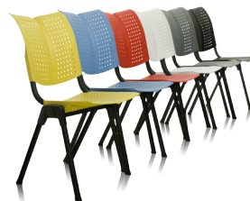
HÅG Conventio Wing 9811 in 6 different colours