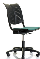
HÅG Conventio Wing 9822