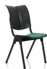
HÅG Conventio Wing 9821