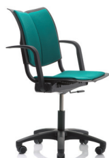
HÅG Conventio Wing 9832 w/armrests (optional)