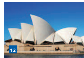
10 MAXXI | Roma, Italia 11 ArtScience Museum, Marina Bay Sands | Singapore 12 Sydney Opera House | Sydney, Australia