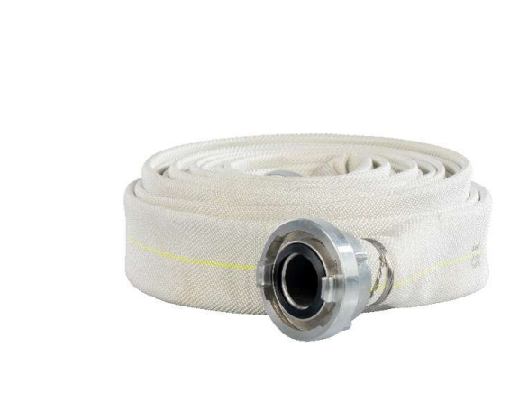
15 m drainage hose with Storz C couplings at both ends for fitting an extension