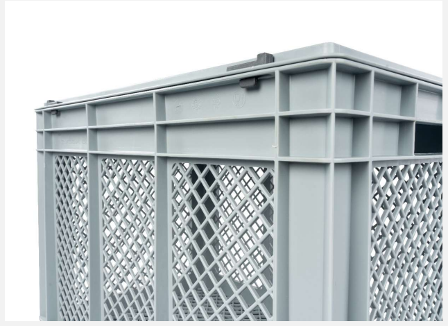
Plastic box for transport and for use as a strainer