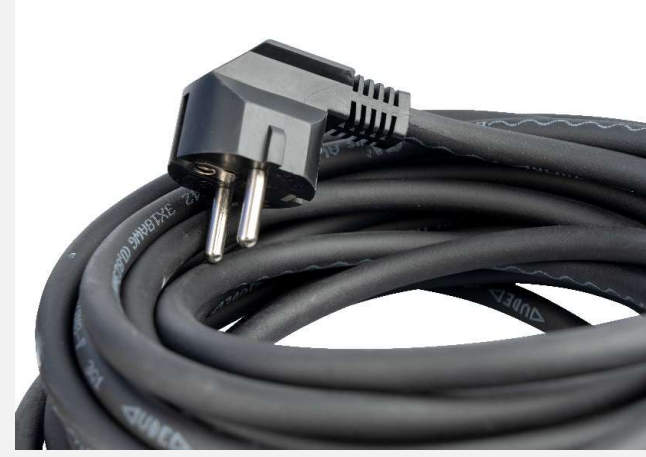
20 m power cable