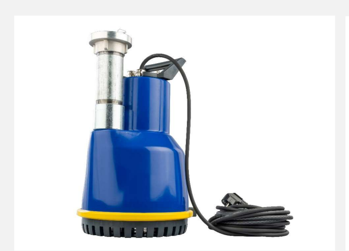
KSB's AmaDrainer 5 submersible motor pump